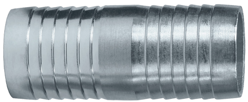
ZINC PLATED STEEL